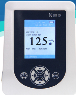
Cork Medical Nisus®

Multipatient, Rechargeable Negative Pressure Wound Therapy System